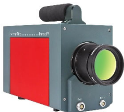
ImageIR® from InfraTec

Huge dump trucks like a Komatsu 960E-1K can carry more than 300 tons of mine rock. When this monster moves on stony soil for many hours a day the workload on those tires is enormous. The long-term tests realised by Bridgestone run in different factories and include parallel inside and outside thermal inspections. The inside inspections are accomplished after several holes have been drilled into the tires carcass, while the outside measurements concentrate on external peripheral structures.