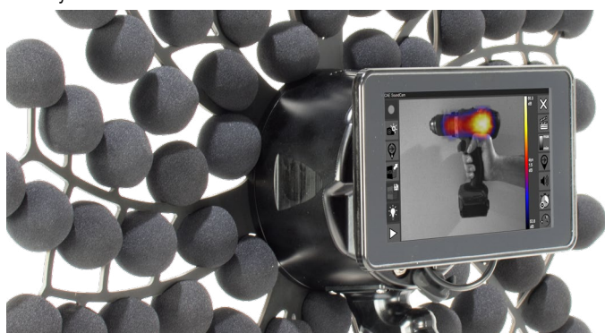
Half Power Beamwidth

The carrying handle on the device and the integrated rechargeable battery make the SoundCam Bionic S suitable for mobile use.